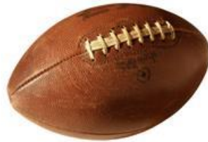
Lewis Chapel "Cardinals"